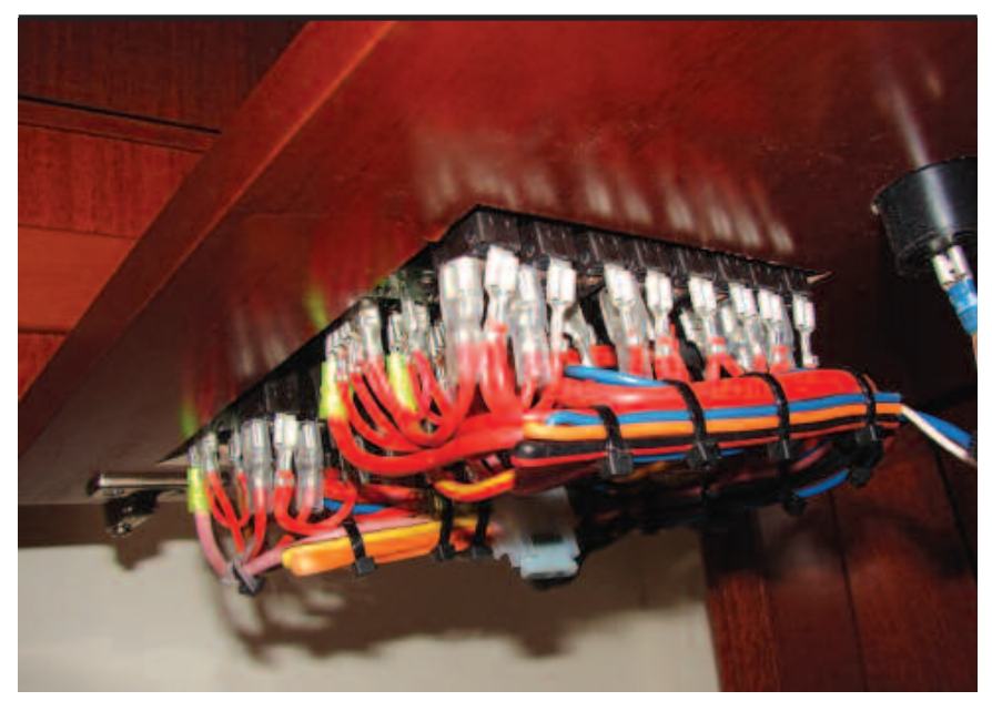
ELECTRICAL SYSTEMS The attention to detail is evident no matter where you look.