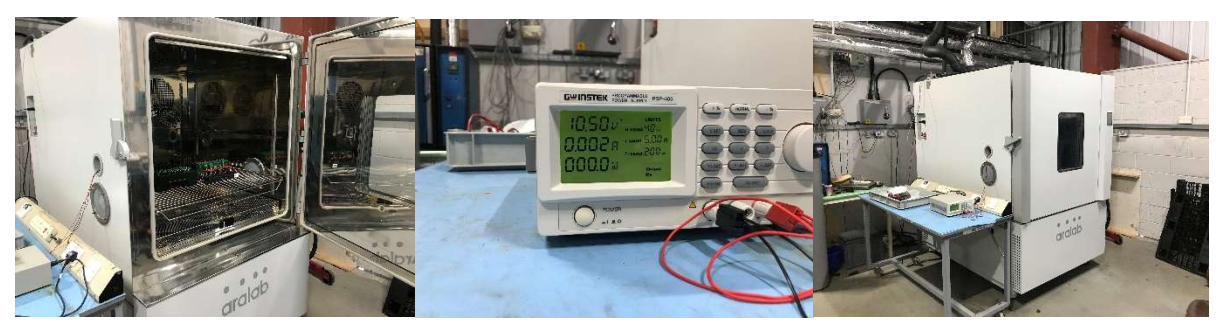
Fig. 2: Test setup at TÜV SÜD.