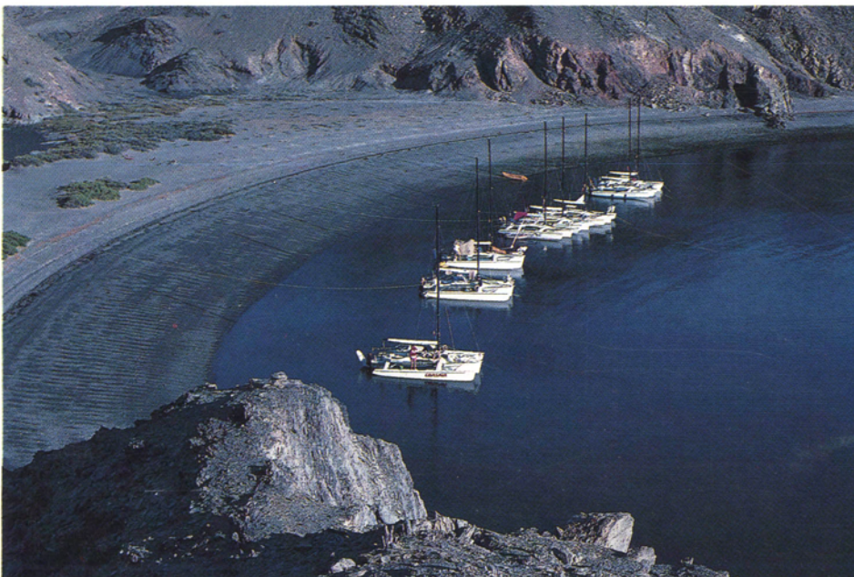
F-27s in Partida Cove, Sea of Cortez.

150 Center St., Chula Vista, CA 91911, Ph. (619) 585-3005 Fax (619) 585 3092